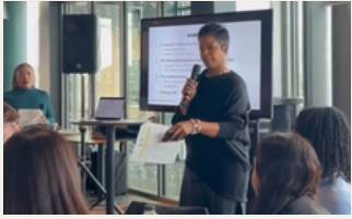
CLE x SJC: CAVS SOCIAL IMPACT ACADEMY SOCIAL JUSTICE 101 FEB '26