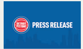
DET x SJC: PISTONS SOCIAL IMPACT SUMMIT FOR SECOND CHANCES APR '26