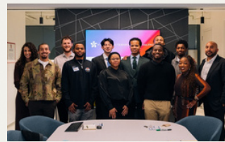
SJC x JUMP: NAT'L YOUTH EMPLOYMENT COALITION SUMMIT JLA PANEL MAR '26